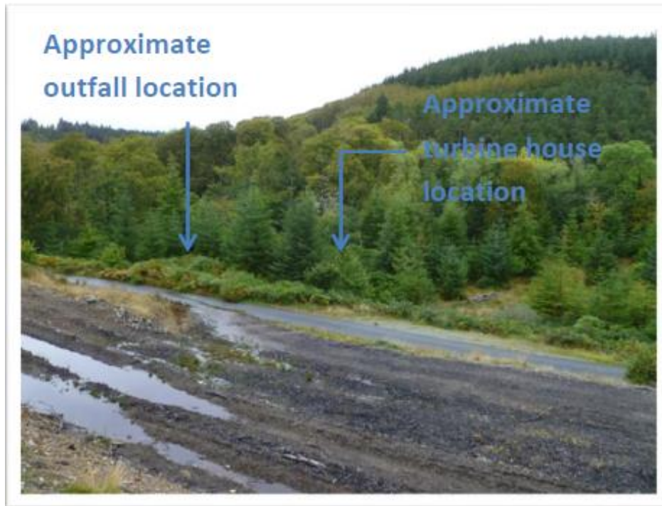
Figure 4 – location of powerhouse, tailrace and outfall

The proposed powerhouse is approximately 440 metres from a grid connection point, although the final cable route may be up to 650m due to local constraints. The two independent schemes will enable a total combined power output of 137kW to be achieved (producing approximately 520,000 kWh per annum).