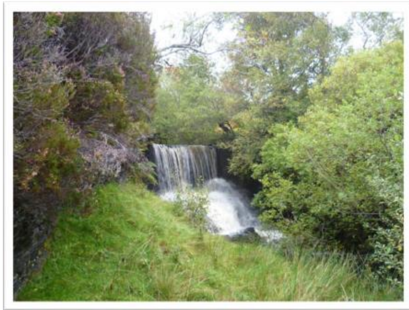
Figure 3 – Mine Burn intake – a pre-fab Coanda dropbox intake would be placed on the weir

The penstock from Inverarish Burn to the powerhouse would comprise of ~1,400 of 400mm diameter PE (Polyethylene) buried pipeline. 880m of 315mm buried PE pipe would be used to convey water from the Mine Burn intake to the powerhouse with both pipes sharing the same trench for the last ~700m. A shared pipeline cannot be used over this lower section as the intakes are at two different heads, so the pipelines operate at different pressures.