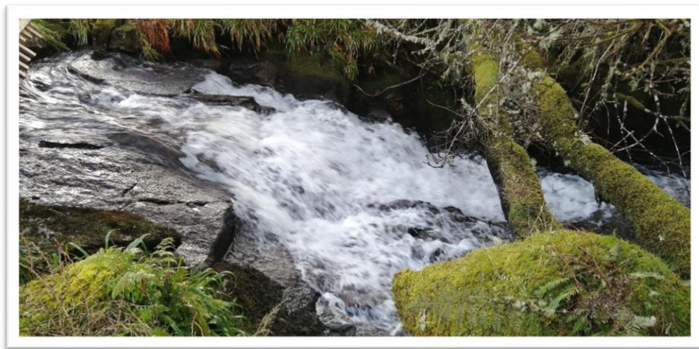
Figure 2 – Inverarish Burn intake - a new Coanda weir would need to be constructed here