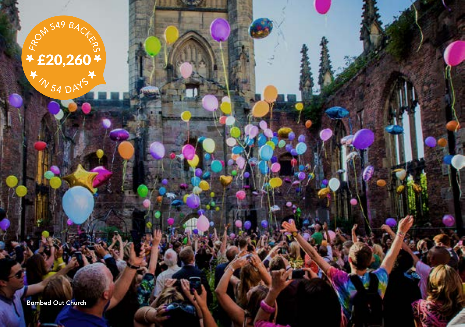
Bombed Out Church

FROM 549 BACKERS ★ £20,260 ★ ★ IN 54 DAYS ★